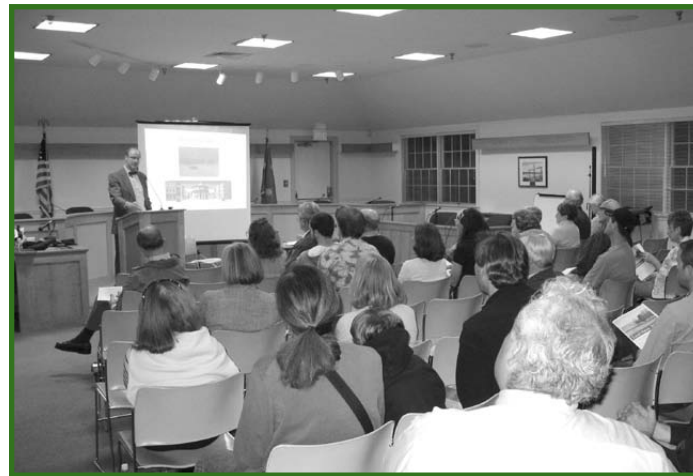
A crowd joins ALT in welcoming James Howard Kunstler as part of ALT's Conservation Speaker Series. The lecture was held at the Portsmouth Town Hall in May 2006.

Art in Ice Atlantic Beach Club, Inc. Bardorf & Bardorf Coach House Condo Association East Bay Picture Frame ESRI Green Valley Country Club Hall Associates Home Depot Jamestown Management Miller Scott & Holbrook Milrose Consultants, Inc. Natural Creations Newport County Chamber of Commerce Newport Gas Light Company NewportFed Newport Running Club Newport Tent Company, Inc. Norman Bird Sanctuary Pendragon Newport Seascope Systems Inc. Silpada Designs Sixteen On Center Starkweather & Shepley - Insurance of Newport Sweet Berry Farm The Platinum House Goldsmith Designers