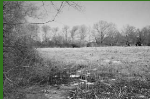
Vaucluse West segment of the Sakonnet Greenway Trail