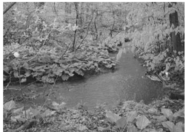
Woods that the Sakonnet Greenway Trail will pass through.