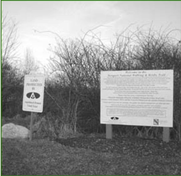
A section of the Sakonnet Greenway around Newport National Golf Club is now open for anyone to enjoy the beauty of Aquidneck Island.