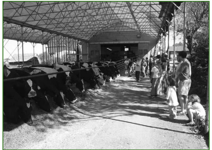
Families join ALT to enjoy Escobar's Highland Farm.