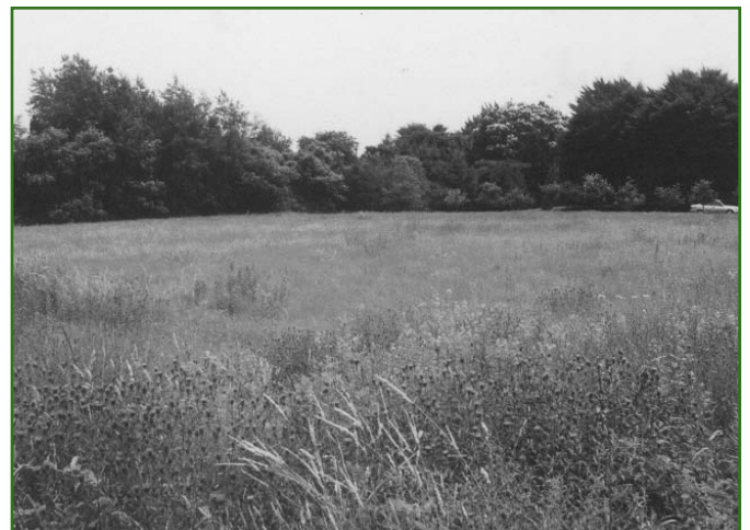
Clubhouse Partners, L.P. Meadow

In June 2005, an agreement to conserve ALT's largest property to date — approximately 483 acres in Portsmouth and Middletown that includes three of Aquidneck Island's public water reservoirs — was signed by ALT, the Town of Portsmouth, and the City of Newport. The agreement will conserve Lawton Valley Reservoir, Sisson Pond, St. Mary's Pond, and all the associated buffer lands in 2006. The agreement will also benefit all three communities on Aquidneck Island because residents from Portsmouth, Middletown and Newport depend on these public water reservoirs.