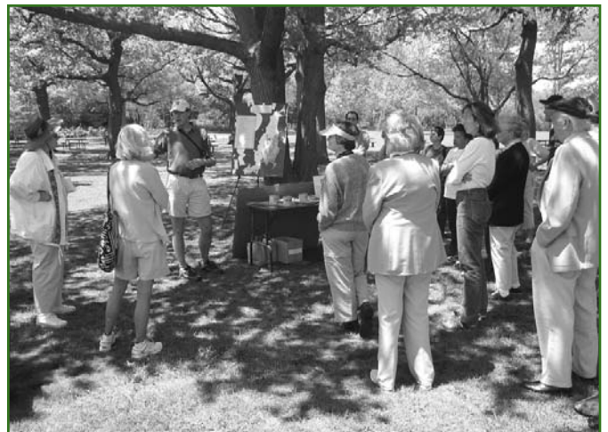
Visitors join the ALT staff for a Walk & Talk at Miantonomi Park on Memorial Day Weekend.