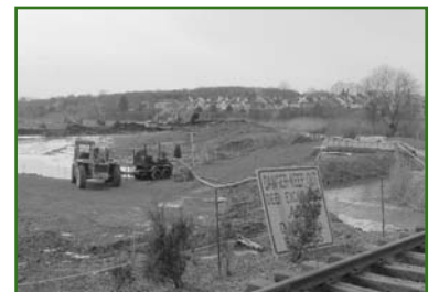
Town Pond Area

This 45.55-acre area was conserved with an ALT conservation easement in March 2005. This marsh, which has been compromised since 1949,