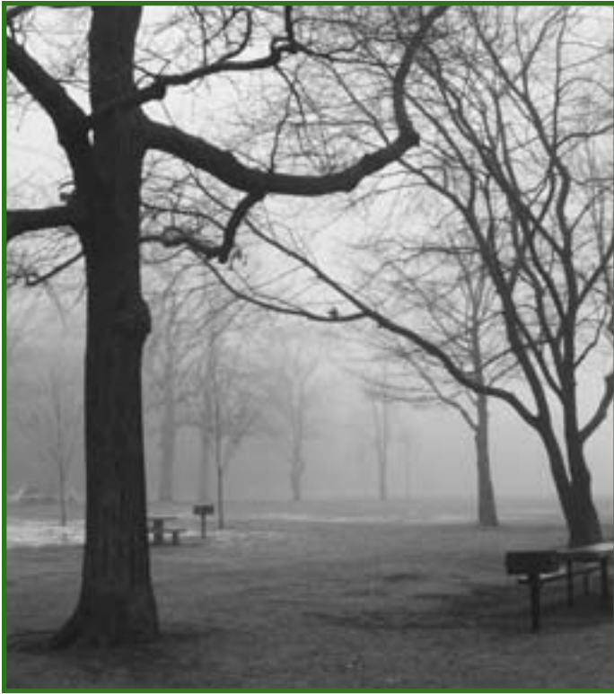
Front Cover and Above: Miantonomi Park, ALT conserved property.