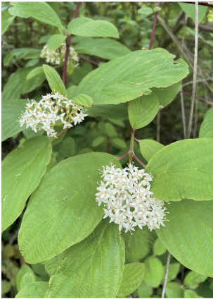
Winterberry ( Ilex verticillata )